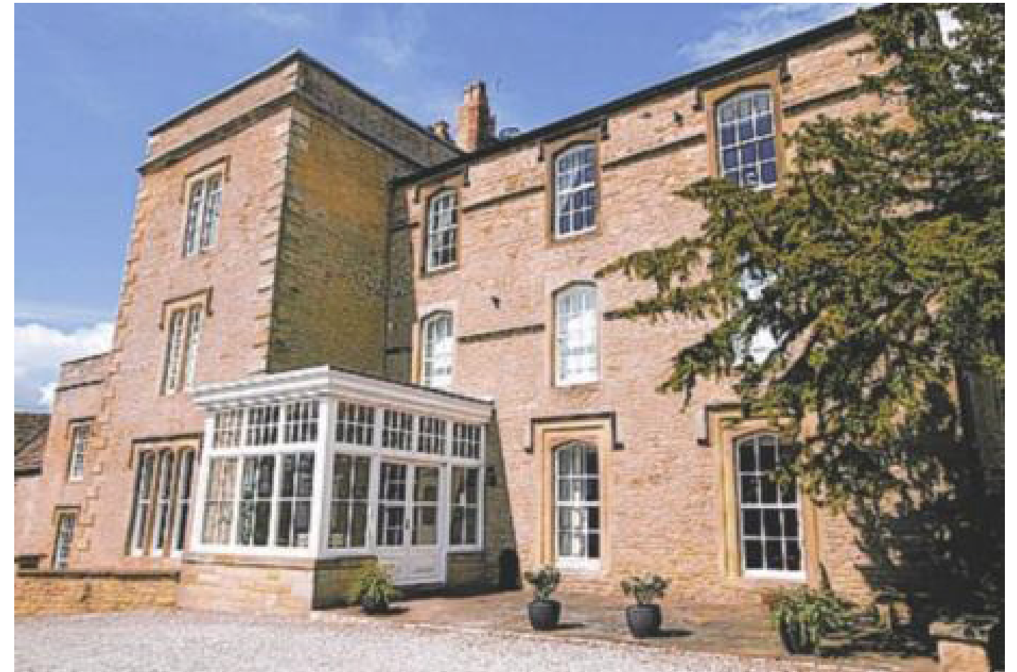
THE TOWERS – WITTON LE WEAR